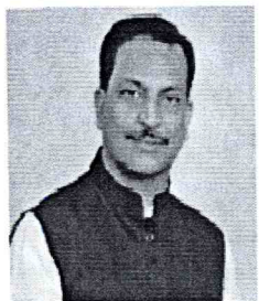
Shri Rajiv Pratap Rudy Minister of State (I/C)